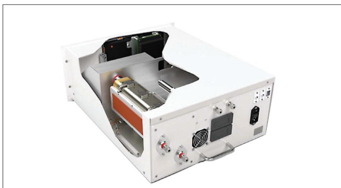
The back and inside of the MAX-iR FTIR gas analyzer.