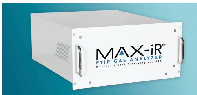
MAX-iR FTIR gas analyzer.

A deuterated triglycine sulfate (DTGS) detector comes standard with the MAX-iR analyzer. With the optional StarBoost technology, users can choose between indium arsenide (InAs) or mercury-cadmium-telluride (MCT) detectors. All systems come standard with Thermo Scientific™ MAX-Acquisition™ Automation Software and MAX-Analytics™ Software that provide industry-leading analytics, factory integration tools, high speed identification of compounds, and measurement accuracy/stability without the need for calibration.