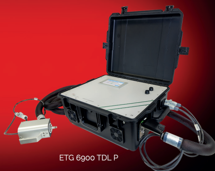
ETG 6900 TDL P