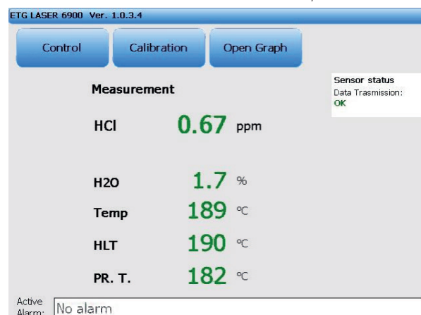
User Interface Overview

*Only applicable to heated configurations