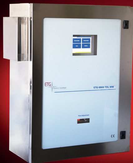
ETG 6900 TDL WM